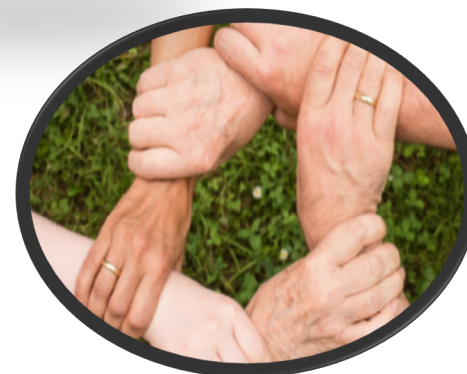
Building working relationships