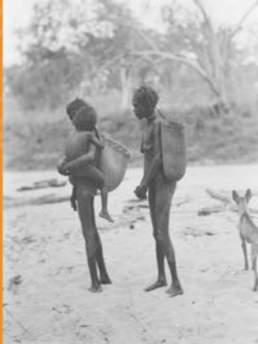
Photo: Aboriginal women, Northern Territory, 1928.