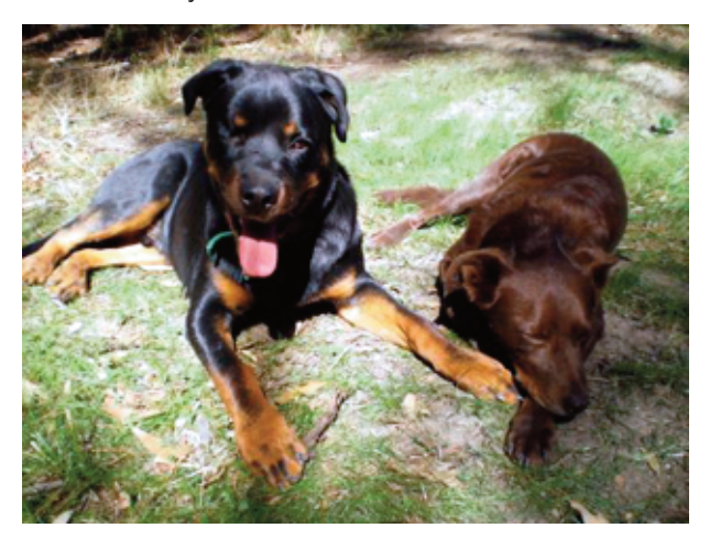
Figure 1 In many current behavioural tests, the behaviour of the dogs in this photo would score similarly due to the fact that they are both lying down with similar body positions, despite their facial expressions and postures indicating quite different responses to the situation. In order to accurately describe each dog's response, detailed information about the size and shape of their eyes, the direction and focus of their gaze, the position of their mouth and tongue and their ear-set would all need to be included in the scoring system.

testers having worked and trained together for several years. This exemplifies the issues plaguing a behaviour-only approach to developing test protocols. The accurate interpretation of subtle canine behaviours is difficult, especially if the dog is apparently doing little. Understanding of canine behaviour and communication requires attention to subtle body language as well as gross body movements, but the sheer volume of information from these subtle signals makes any test incorporating these completely impractical for general use (Figure 1). Furthermore, even with extensive training and experience, a tester's previous experiences with dogs or breeds, and their own understanding of canine nature, will inevitably influence results where any subjective interpretation of behaviour is required or allowed. Tests must be based on easily observable, objective measures if the results of tests carried out by one person, are going to aid interpretation of tests carried out by others. It seems unlikely that either of these two issues will be addressed fully while the focus of test developers remains solely on behaviour.